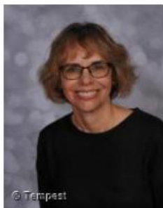
Miss Brake (Headteacher)

Other designated members of staff for Child Protection are: