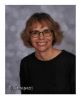
Miss Brake (Headteacher)

Other designated members of staff for Child Protection are: